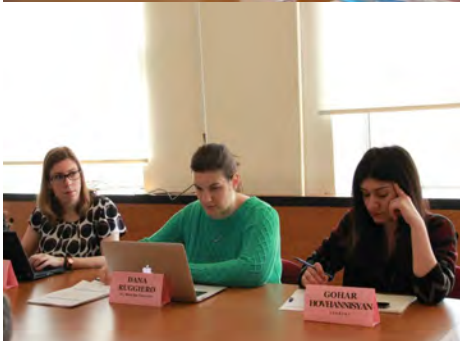
External review at PAARA, March 2017