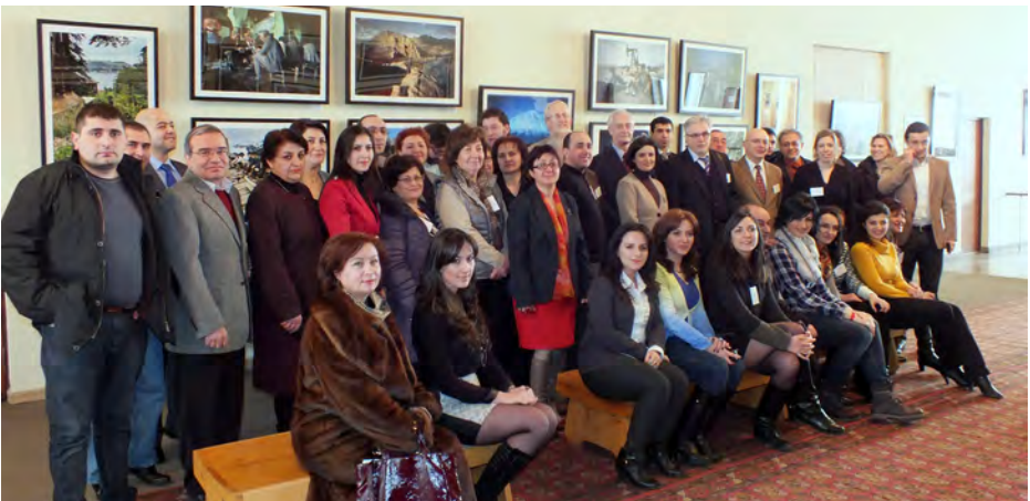
GOVERN project Kick-off meeting, January 2014

The overall management of the project is under the responsibility of the Project Governing Board (PGB) and was established to include all the consortium members and take care of the strategic issues and decision-making. The PGB was presided by the Rector of the YSAFA and included all the rectors of HEIs, MoES, ANQA, EU partners to ensure top-management active involvement in the project and its sustainability.