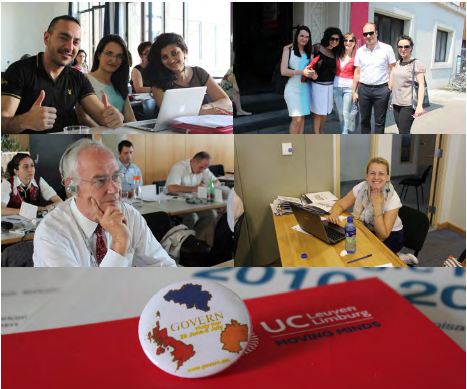
GOVERN project Study visit, July 2015

The study visit impacted a lot to the developments of the HEI management system and staff participated in the study tour disseminated the information among the working groups.